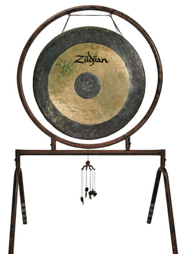
(photos right: talking drum, left: "Songbird" baby grand piano and bottom right: Zildjian gong)