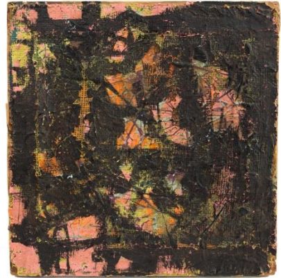
(Frank Zappa Original Burlap Painting)

REGISTERING TO BID: Registration is required to bid in this live auction and can be done in person at the exhibition and auction, or online before the sale at the JuliensAuctions.com Registration page to bid by phone, proxy or in person, or online at JuliensLive.com to bid live online, or by calling (310) 836-1818.