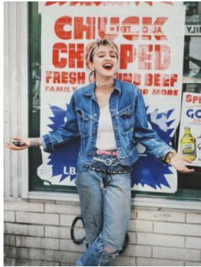
(Madonna original Richard Corman photograph, one of many to be offered)

Other highlights of the very special auction include John Lennon’s Bath Robe (Estimate: $9,000-$10,000), Jimi Hendrix’s ring presented in a carved wooden box (Estimate: $8,000-$10,000), Jimi Hendrix’s jacket (Estimate: $4,000-$6,000), Britney Spears’ music video worn bra (Estimate: $1,500-$3,000), Beyonce’s “Haunted” music video worn crown (Estimate: $1,500-$3,000) and video worn cape (Estimate: $1,500-$3,000), Pharrell Williams’ Elle UK Cover worn Native American headdress (Estimate: $8,000-$10,000), Miley Cyrus’ VH1 Divas Latex Bolero jacket (Estimate: $2,000-$4,000), Frank Sinatra’s 1970s-1990s address book (Estimate: $7,000-$9,000), a variety of iconic items from Lady Gaga including Lady Gaga’s Stage Worn Latex Body Suit (Estimate: $6,000-$8,000), a Lady Gaga stage worn face mask (Estimate: $2,000-$4,000) and a Lady Gaga worn leather corset (Estimate: $2,000-$4,000) and Cher’s turquoise leather boots (Estimate: $400-$600).