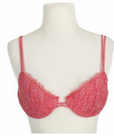
(Britney Spears video worn bra)

The unprecedented collection also includes a rare Michael Jackson red face mask (Estimate: $1,000-$2,000), a Michael Jackson Victory Tour jumpsuit (Estimate: $10,000-$15,000), a Michael Jackson owned pair of Aviator sunglasses (Estimate: $2,000-$4,000), a Michael Jackson Dangerous Tour costume (Estimate: $10,000-$20,000) and a Michael Jackson military style jacket worn to the Hall of Fame inductions (Estimate: $10,000-$20,000). The Beatles memorabilia includes a rare signed “Hard Day’s Night” album cover (Estimate: $50,000-$70,000), Beatles signed documents (Estimate: $20,000-$25,000), a rare signed Beatles “Please, Please Me” album cover (Estimate: $30,000-$50,000), a John Lennon erotic drawing (Estimate: $6,000-$8,000) and a John Lennon played piano from The Record Plant ($40,000-$60,000) and many more.